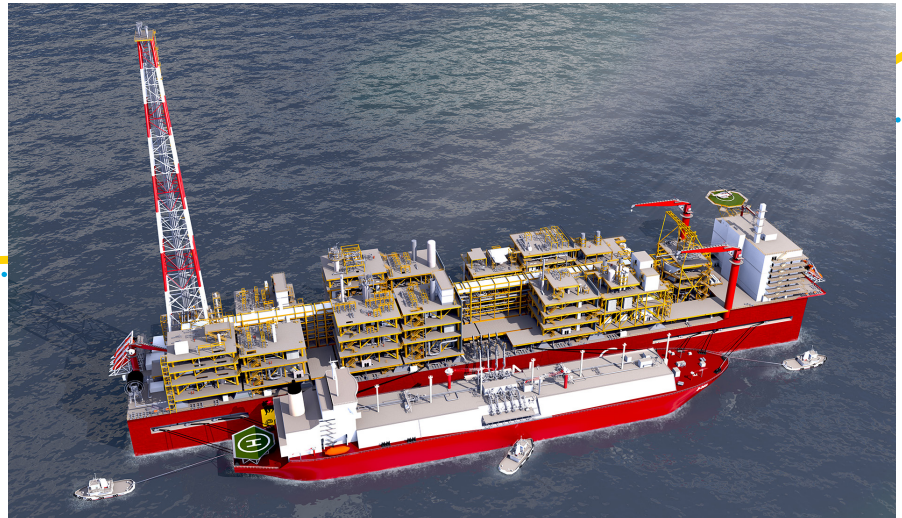
Coral South FLNG facility utilizing Air Products AP-DMR™ LNG Process—3.4 mtpa due to come onstream in 2022 offshore Mozambique. (Graphic courtesy of ENI)

Air Products' cryogenic equipment and natural gas liquefaction processes have become the standard for baseload LNG, both onshore and offshore. Our liquefaction systems are widely used because of their proven low cost, high reliability, high efficiency, reduced carbon footprint and operational flexibility. Air Products has tailored its cryogenic equipment designs and developed natural gas liquefaction processes specifically for the unique offshore environment of an FLNG facility.