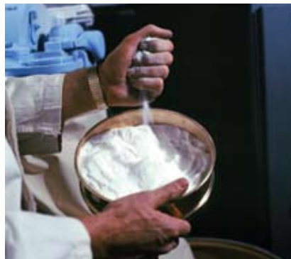
Fine grinding is possible with cryogenic grinding systems. These systems achieve ultra-fine particle sizes and uniform particle distribution while maximizing production rates and minimizing overall operational costs.

Amorphism is a phenomenon of materials where there is no long-range order of the molecules within the compound. Amorphous materials exist in two distinct states: rubbery or glassy. As applied in most industrial environments today, amorphism is the basis for cryogenic grinding. This behavior can be observed from the