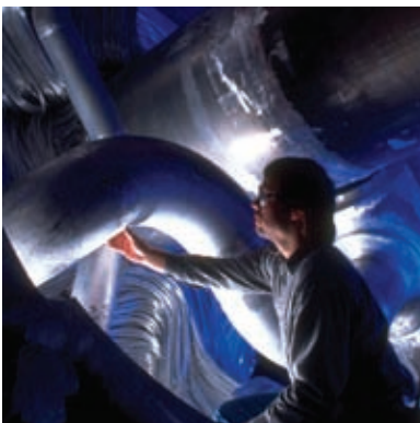
Careful inspections ensure high quality of our equipment.

We design and operate our facilities throughout the world to the highest safety standards. We have earned more safety-related awards than any other industrial gas company. Year after year, we stand among the top performers of the American Chemistry Council.