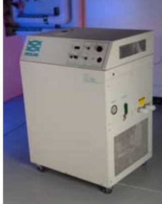
Neslab HX 150