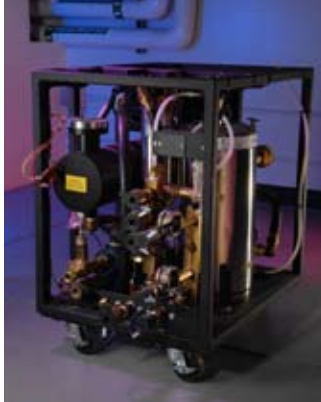
Applied Materials O heat exchanger