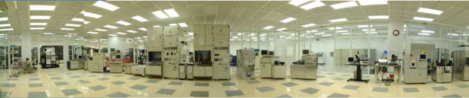
Air Products' Chandler clean room facility.