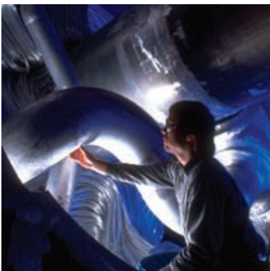
Careful inspections ensure high quality of our equipment.

We design and operate our facilities throughout the world to the highest safety standards. We have earned more safety-related awards than any other industrial gas company. Year after year, we stand among the top performers of the American Chemistry Council.