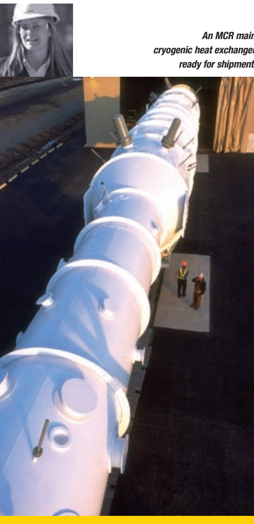
An MCR main cryogenic heat exchanger ready for shipment.