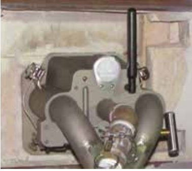
Figure 2: HR e burner installed in a glass plant.