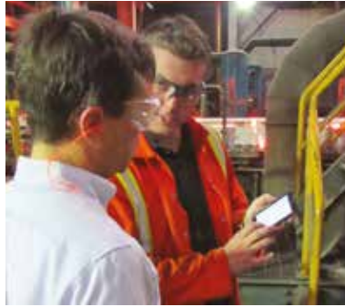
Figure 3: Use of HR e real-time data.

depending on the furnace environment. Since the burner is battery-powered and communicates wirelessly, once installed, the burner data are immediately accessible both locally and remotely.