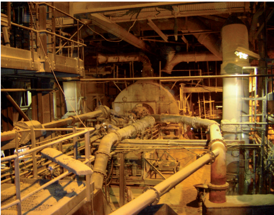
Above: Kiln at Thrislington .

ton, Steetley was also able to sustainably increase lime production on average by 10%.