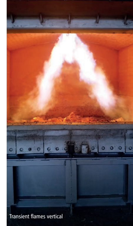
Transient flames vertical