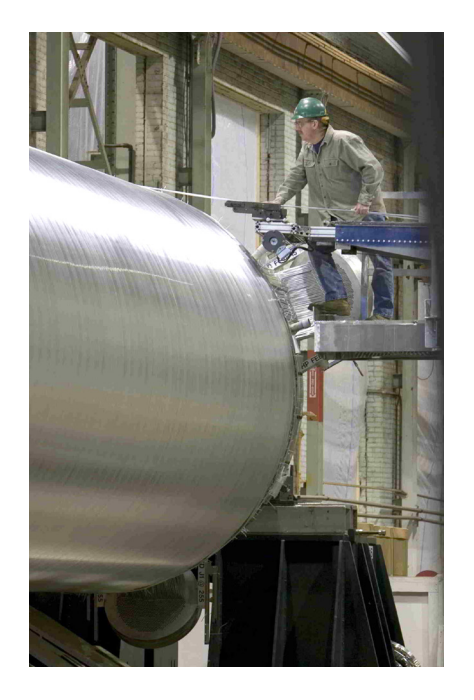
The bundle winding process for each coil wound heat exchanger manufactured by Air Products.