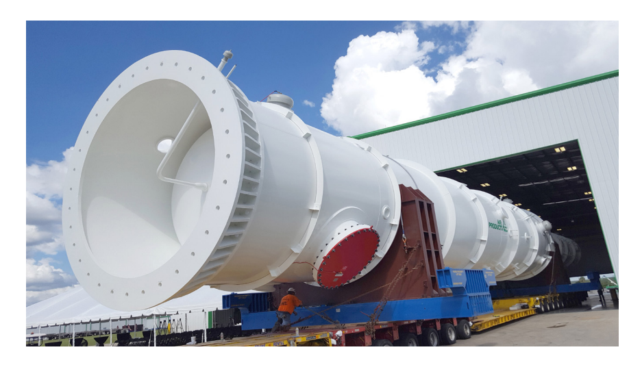
A large Air Products' custom designed coil wound heat exchanger.

For the AP-X® LNG Process, in addition to liquefaction process design and CWHEs (Coil Wound Heat Exchangers), Air Products designs and manufactures cryogenic nitrogen companders (compressor turbo-expander machinery), and nitrogen economizer heat exchanger cold boxes.