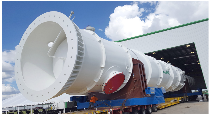
A large Air Products' custom designed coil wound heat exchanger.

For the AP-X® LNG Process, in addition to liquefaction process design and CWHEs (Coil Wound Heat Exchangers), Air Products designs and manufactures cryogenic nitrogen compressors (compressor turbo-expander machinery), and nitrogen economizer heat exchanger cold boxes.