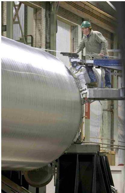
The bundle winding process for each coil wound heat exchanger manufactured by Air Products.