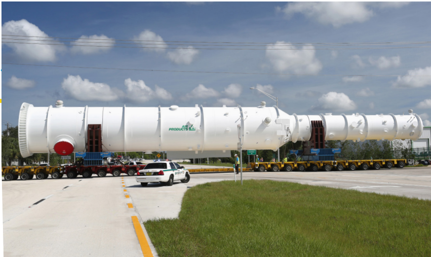
Air Products' natural gas liquefaction processes and main cryogenic heat exchangers are the world's standard for baseload LNG.