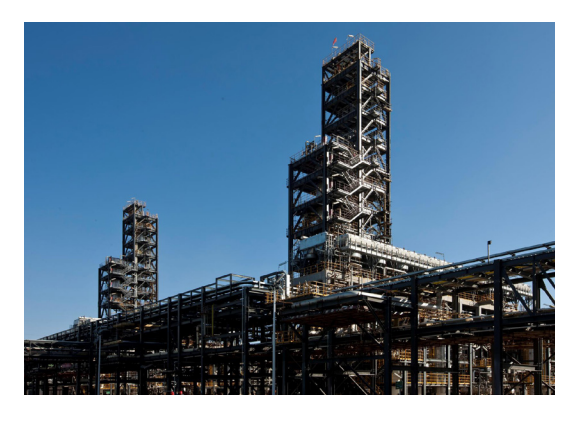
Air Products' coil wound heat exchangers are proven safe and reliable.