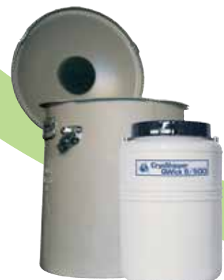
Dry vapour shippers

Working alongside Chart Biomedical, world leaders in cryogenic storage vessels, we provide the optimum solution for your needs: from the supply of liquid nitrogen to the safest and most economical storage of your samples.