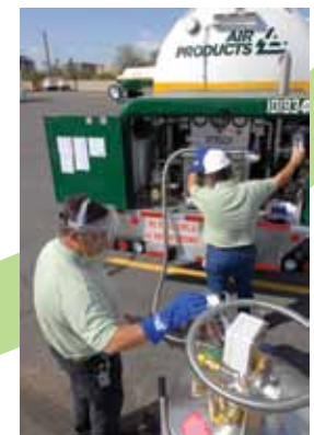
Liquid and cylinder gas supply