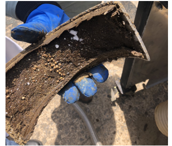
Clogged with seed oil buildup without liquid nitrogen