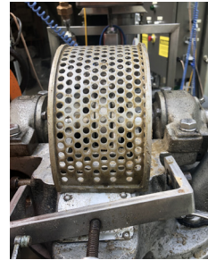
Clean Mill screen using liquid nitrogen