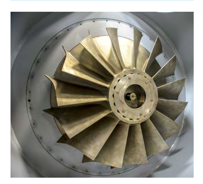
Figure 4. The Rotoflow product line provides cryogenic turbomachinery for refrigeration and energy recovery in a wide range of plants. This 16R has found its home in some of the world's largest existing liquefaction facilities.

the turbine. The nozzle position is typically controlled by the DCS via an electric actuator.