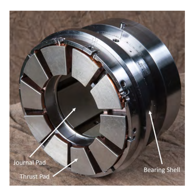
Figure 3. Combination journal and thrust tilting pad bearing.

The new offering incorporates adjustable inlet nozzles to increase the flow range. The inlet nozzles direct the flow of the process fluid into the expander impeller. By adjusting the throat or the distance between the adjacent nozzles, the flow through the expander can be controlled while maintaining the inlet and outlet pressures of